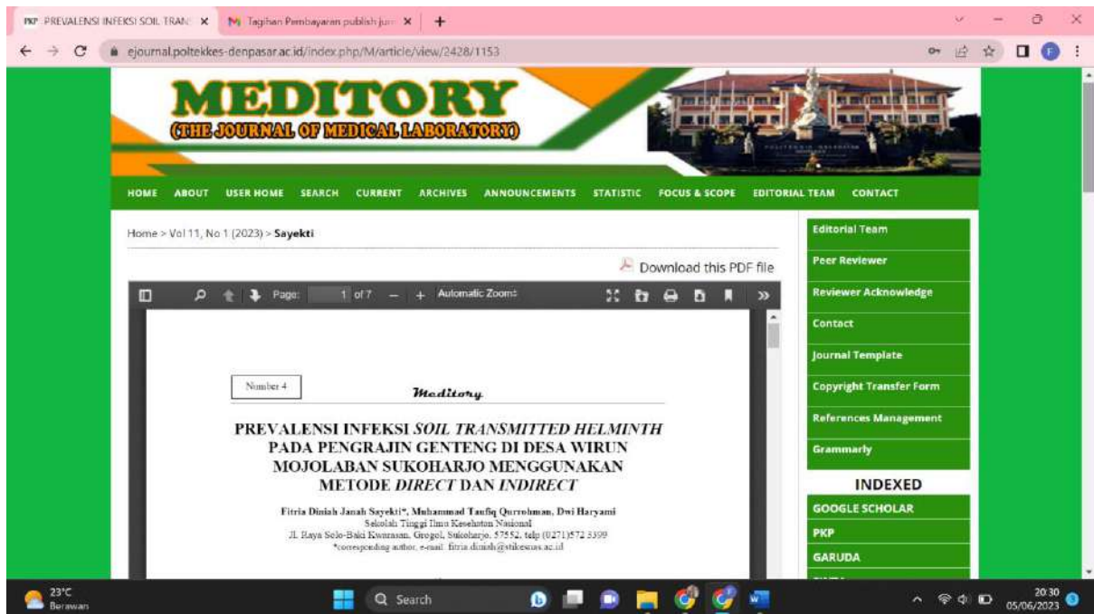
Bukti artikel telah terbit di jurnal Meditory Vol 11, No 1.