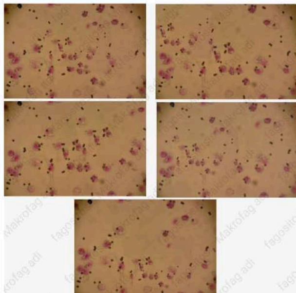
Microscopic image of Replication of 6 test animals